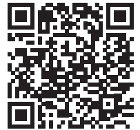
Easter Egg Hunt

Donations of non-melting candy to go inside small plastic eggs are needed. You can bring candy now through April 6. Collection baskets are in the narthex and gazebo.